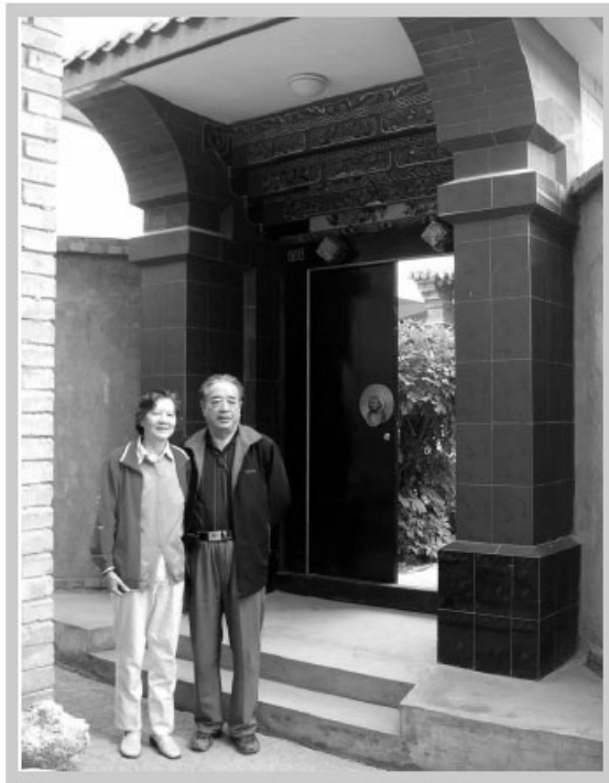
Standing in front of their house in Hezheng, 2006.