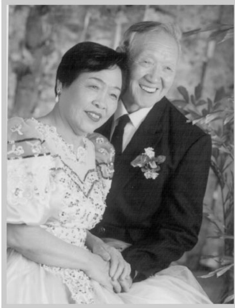
Renewal of their wedding vows, 1997.