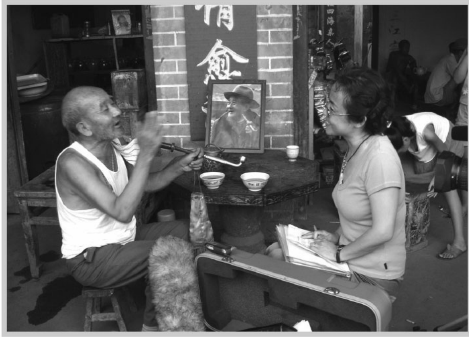
The news singer reciting, Linhuan, Anhui province, 2006.