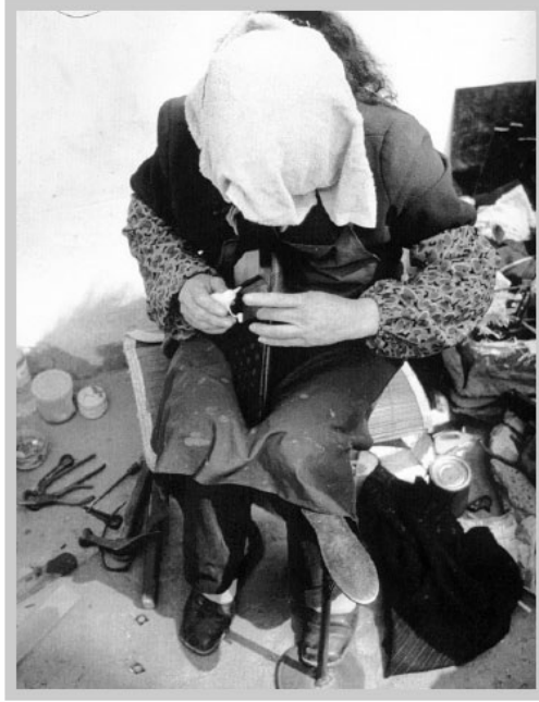
The shoe-mender woman, Zhengzhou, was at first shy of our camera . . .