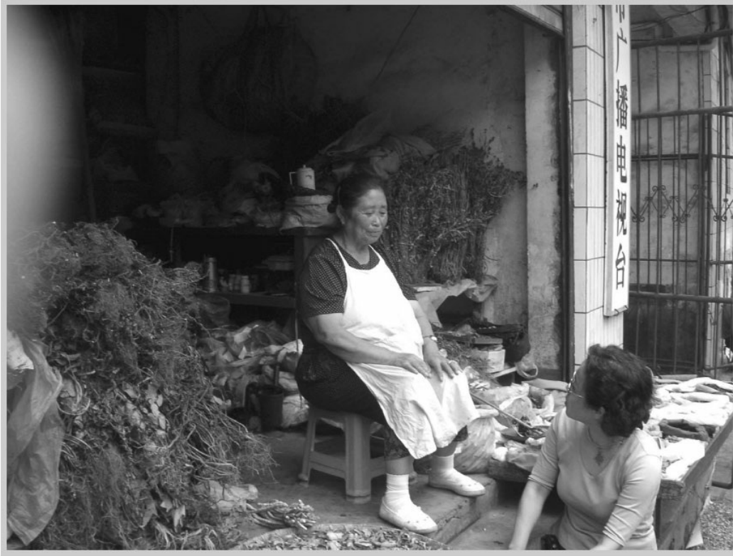
Sitting on the step of Yao Popo's herb shop.