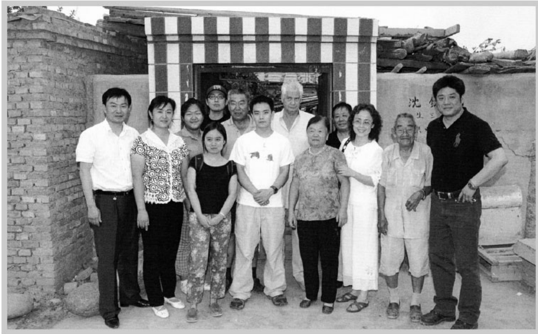
With survivors of 148 Corps, 2006.