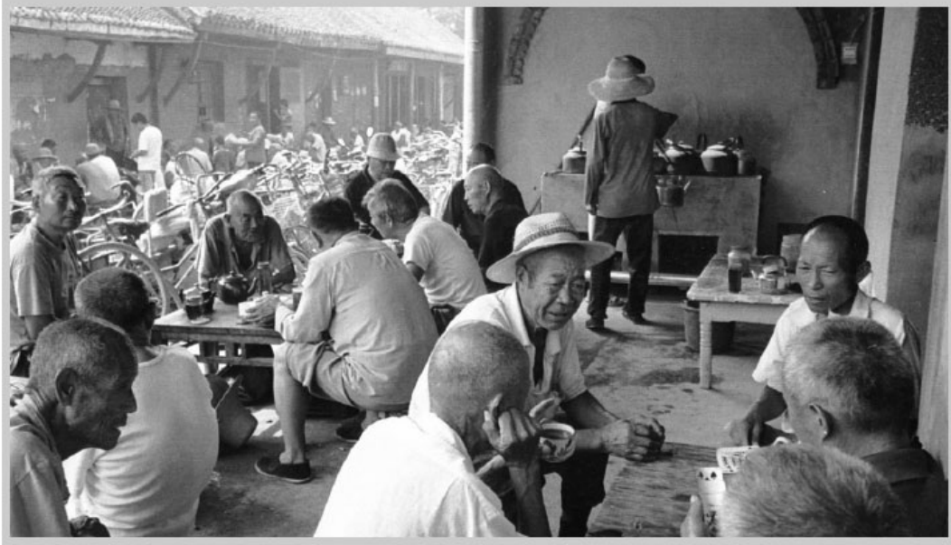
A typical traditional tea house, full of men, Linhuan, Anhui province, 2006.