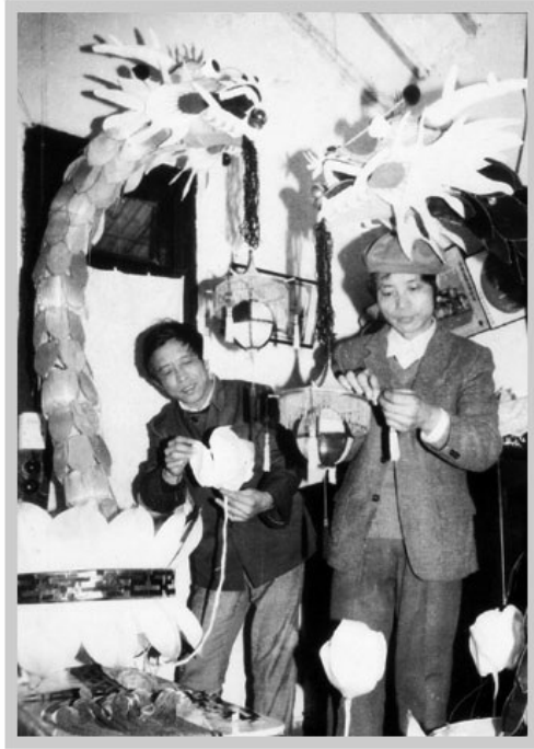
The Huadeng brothers in their workshop, Nanjing, 1950s.