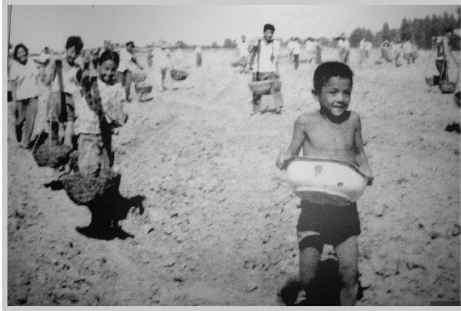
Workers of 148 Corps in the 1950s.